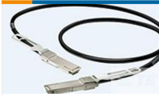
TE Part # 2829040-8 QSFP IB EDR, 26AWG, 3.0M