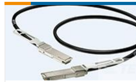
TE Part # 2829040-7 QSFP IB EDR, 26AWG, 2.0M