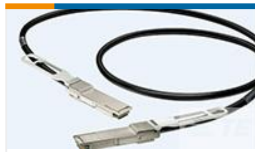
TE Part # 2829040-4 QSFP IB EDR, 30AWG, 1.0M