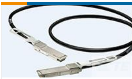
TE Part # 2829040-2 QSFP IB EDR, 33AWG, 1.0M