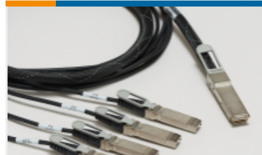
TE Part # 2821033-8 QSFP TO [4]SFP+, 28G, 1M, 33AWG