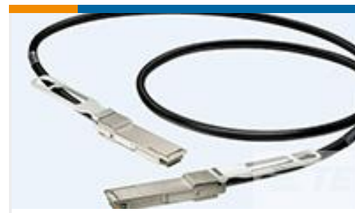
TE Part # 2829040-6 QSFP IB EDR, 30AWG, 2.0M